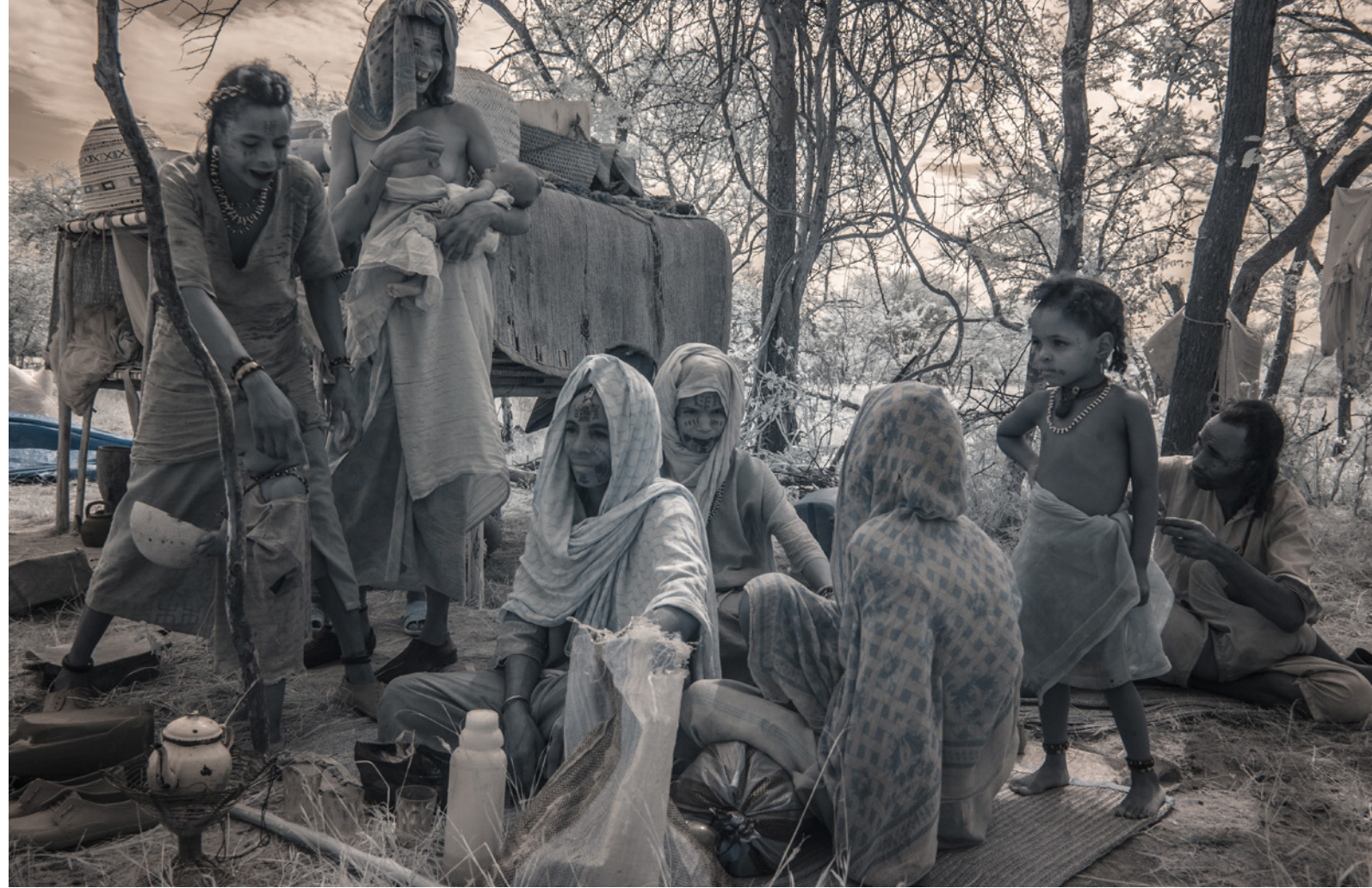
Terri Gold © All rights reserved