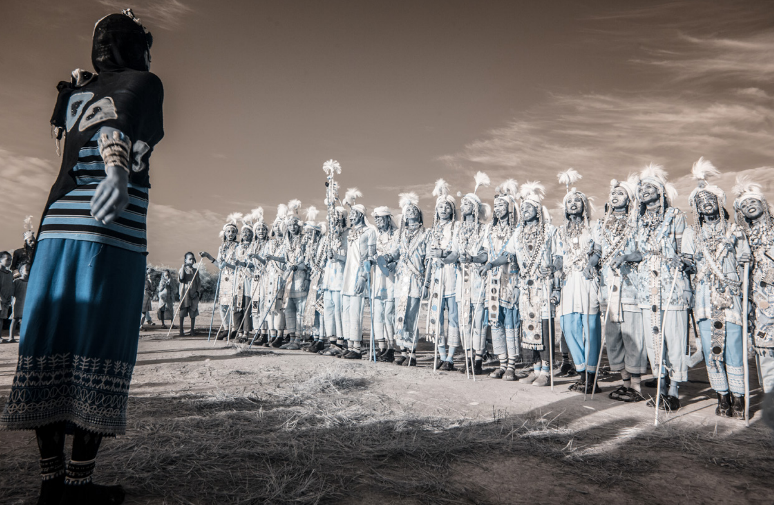
Terri Gold © All rights reserved