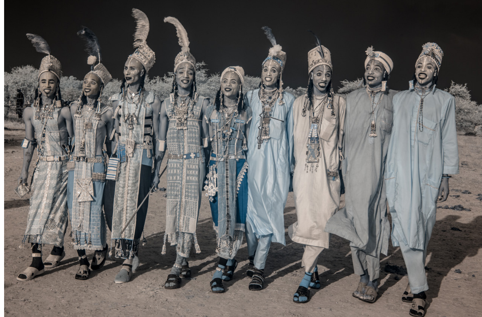
Terri Gold © All rights reserved